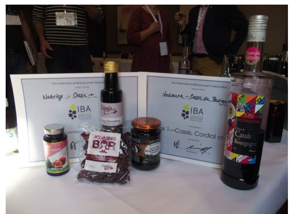
Blackcurrant product competition – the winners

An amazing range of blackcurrant products from all over the world has been presented in Ashford: juices, liqueurs and other drinks, jams, vinegars, purees and more “exotic” products like apple rings or fruit pastes, and some nutraceuticals. Impossible to name all the participants in a short notice like this – and the panel had difficulties finding the winners.