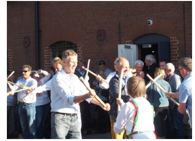
Conference participants learn Morris dancing

More authentic even: the delegates were introduced to Morris dancing. After examining the professional dancers, the conference participants were given the opportunity to participate themselves.