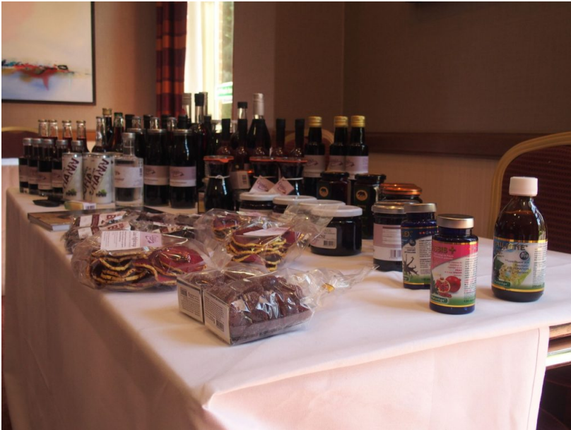
Blackcurrant product competition