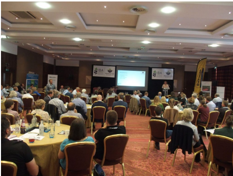
IBA conference Ashford, 14th - 16th June

It is impossible to relate everything in detail, but it's worth having a look at what you may have missed - or remind some delightful moments if you were among us.