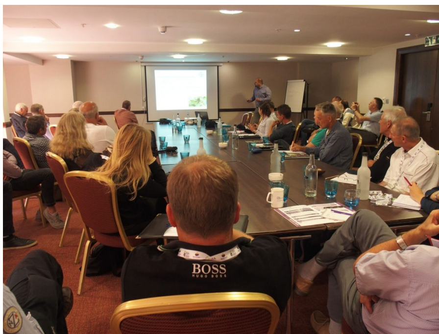
Agronomy & Plant Breeding Sector Group Meeting, 14th June

Congratulations to the winners, and a huge THANK YOU to all the participants in the contest!